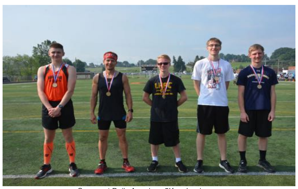
Somerset Daily American 5K male winners