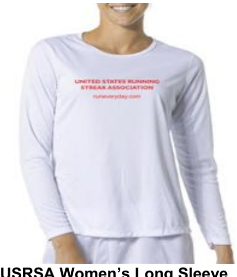
USRSA Women's Long Sleeve