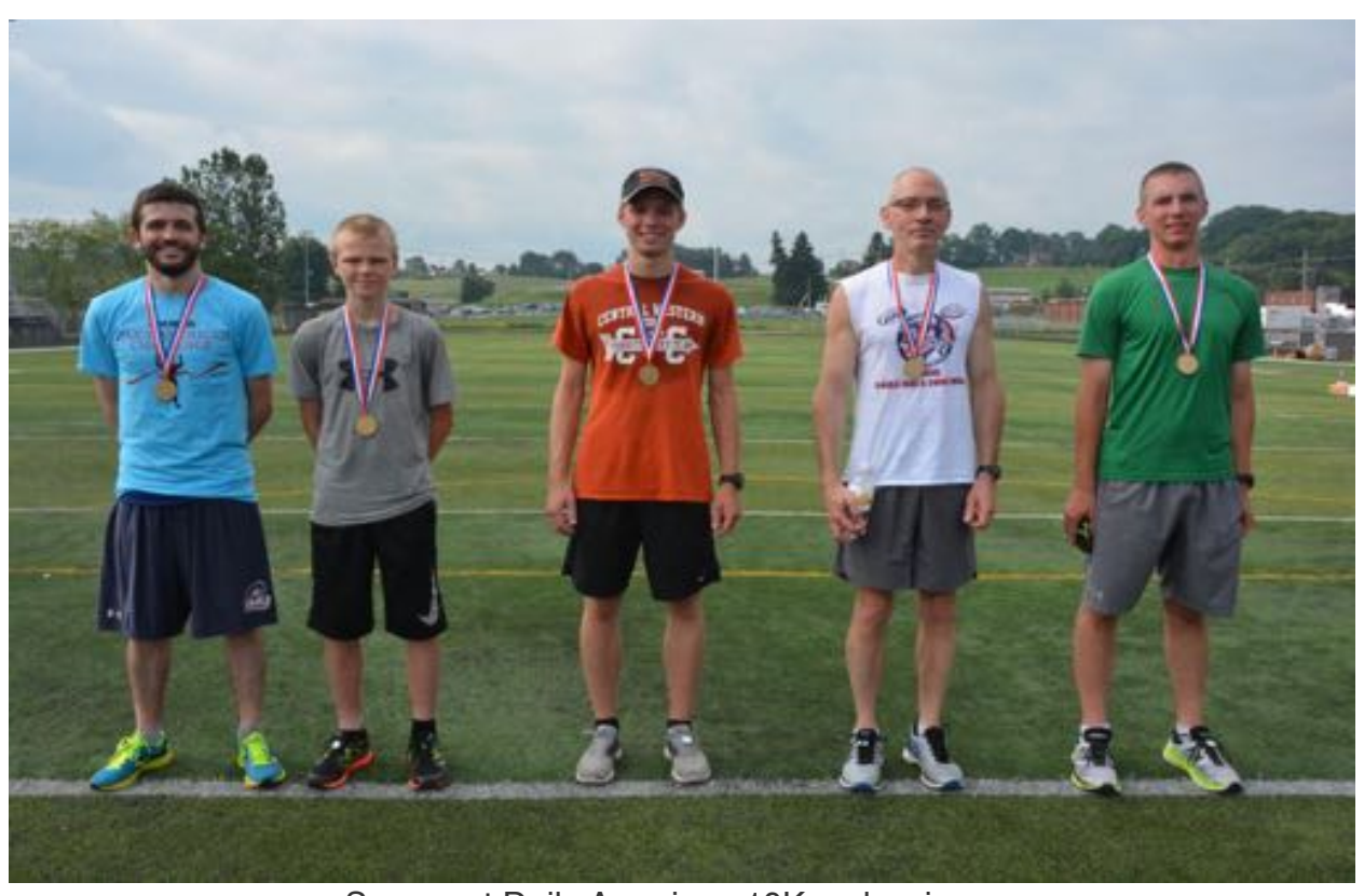
Somerset Daily American 10K male winners